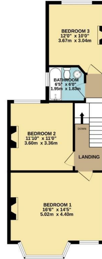
1ST FLOOR 576 sq.ft. (53.5 sq.m.) approx.